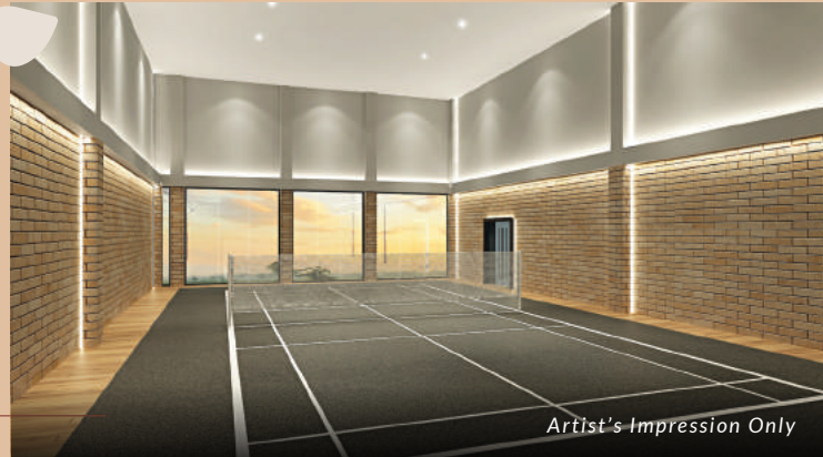
Playing up a racket in the badminton hall