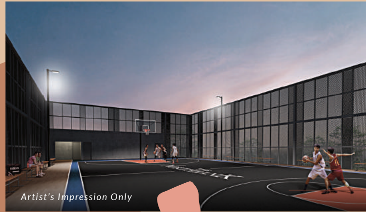
Shoot some hoops at the outdoor court