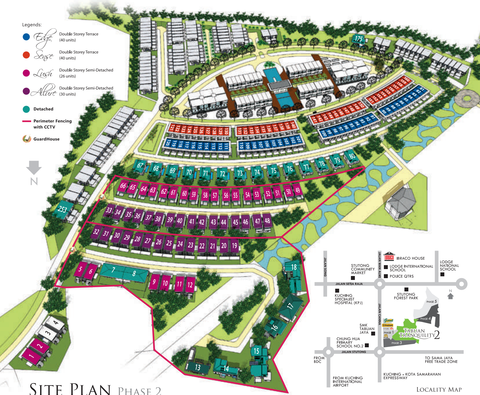
SITE PLAN PHASE 2