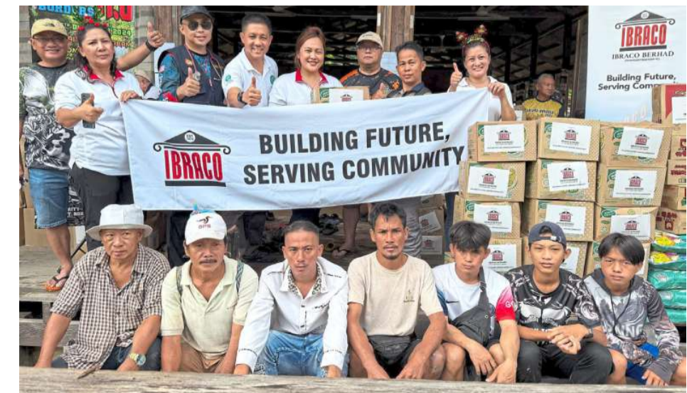
Ibraco handing over food aid to the Penan community.