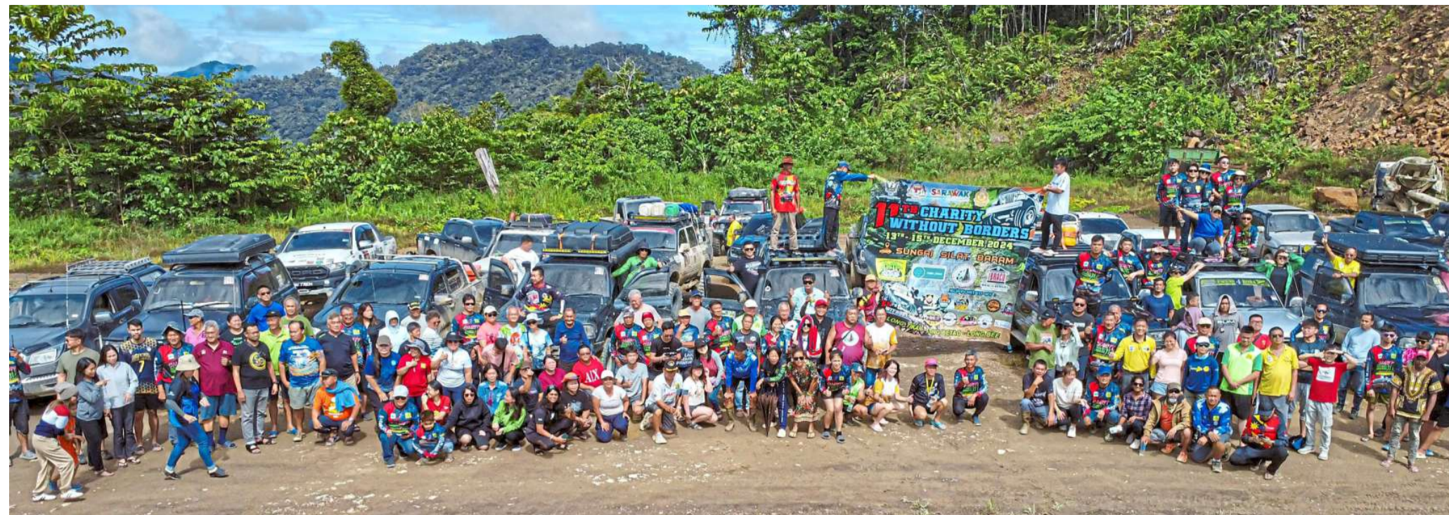
Over 200 volunteers took part in the Charity Without Borders programme last December.