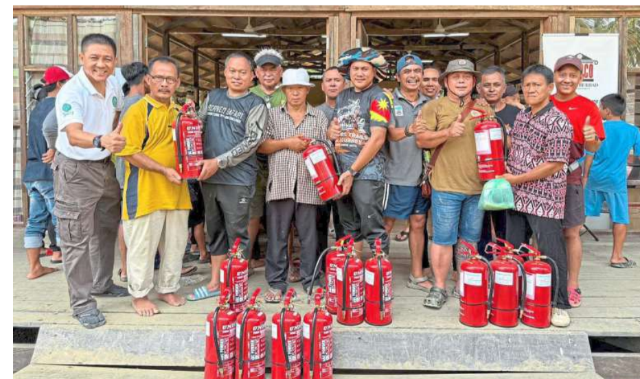
Bhd. 15 fire extinguishers for three Penan villages were also distributed.