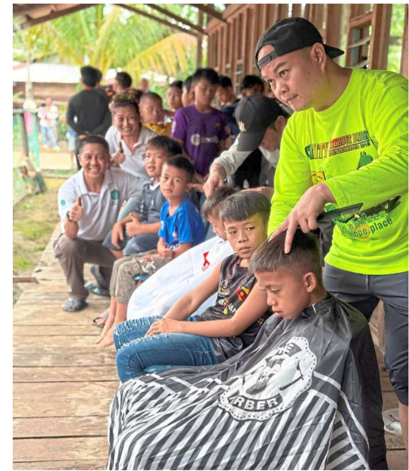
Volunteers from a hair salon providing free haircuts to the villagers.

As the team packed up after four impactful days, they left behind not just supplies and medical relief but a powerful message of hope and compassion for a community that often feels forgotten.