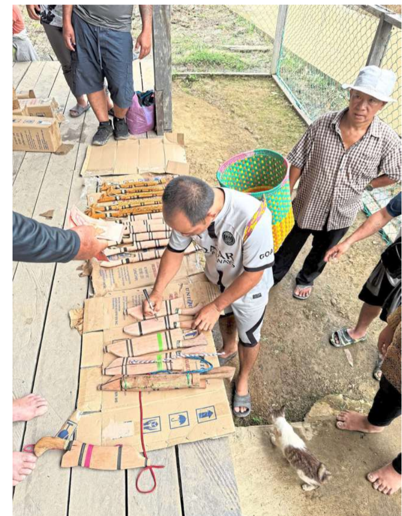
Penan villagers selling their handicrafts during the programme.