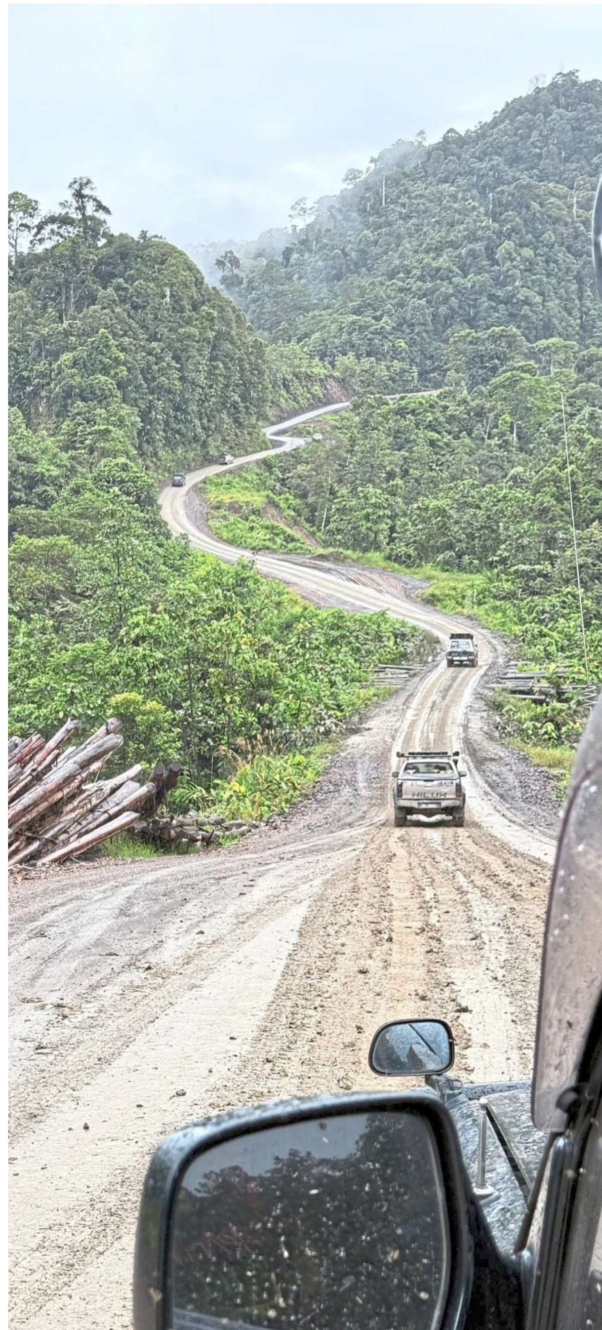
The journey to Long Tikan involved travelling on unpaved, logging roads.