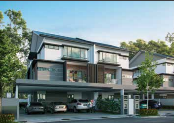
THE NORTHBANK LANDSCAPE