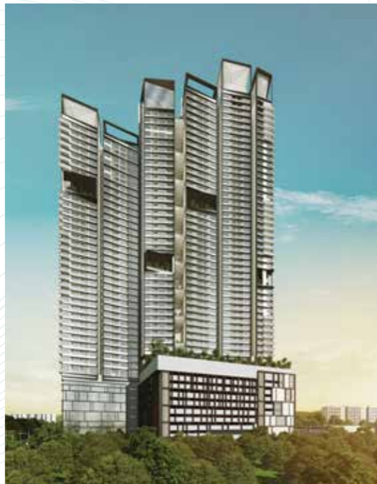
Left: The artist impression of Continew. Right: The actual site at the current stage.