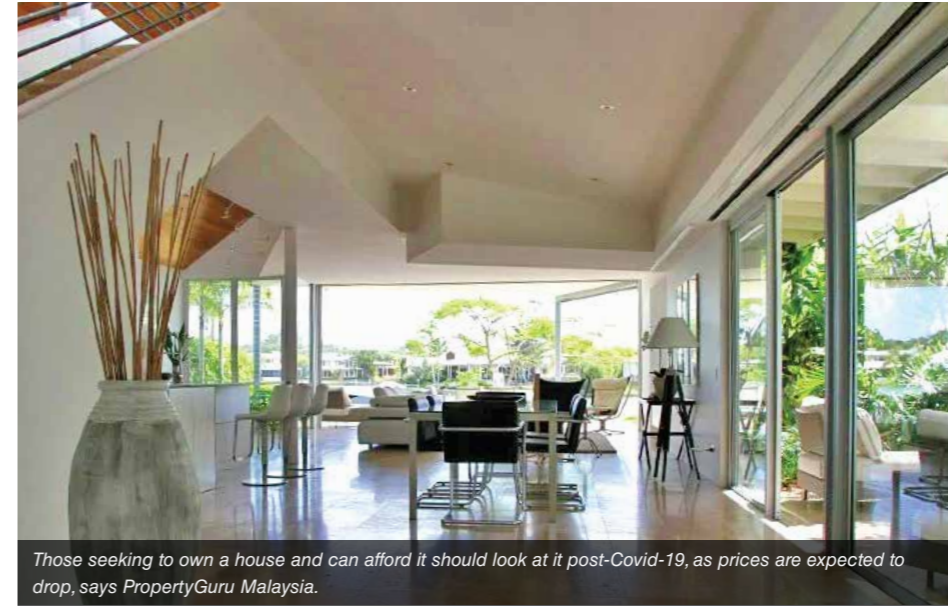
Those seeking to own a house and can afford it should look at it post-Covid-19, as prices are expected to drop, says PropertyGuru Malaysia.

Property investors and those who seek to own houses and can afford it are encouraged to buy in the short term post-COVID-19, as prices are expected to drop.