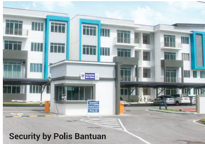
Security by Polis Bantuan